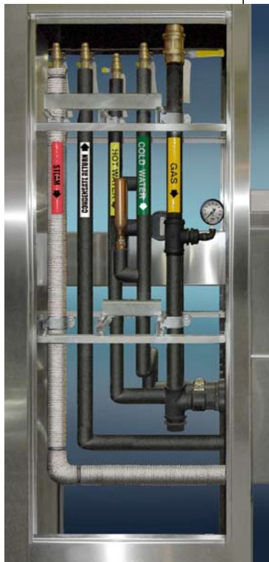
Custom configuration according to your kitchen's specifications

Add, remove, rearrange and service appliances with ease, and eliminate unsightly and unsafe excess wiring, pipes & clutter